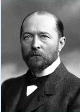
Emil Adolf von Behring